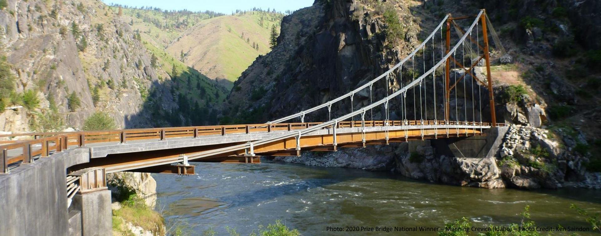
Photo: 2020 Prize Bridge National Winner – Manning Crevice (Idaho)