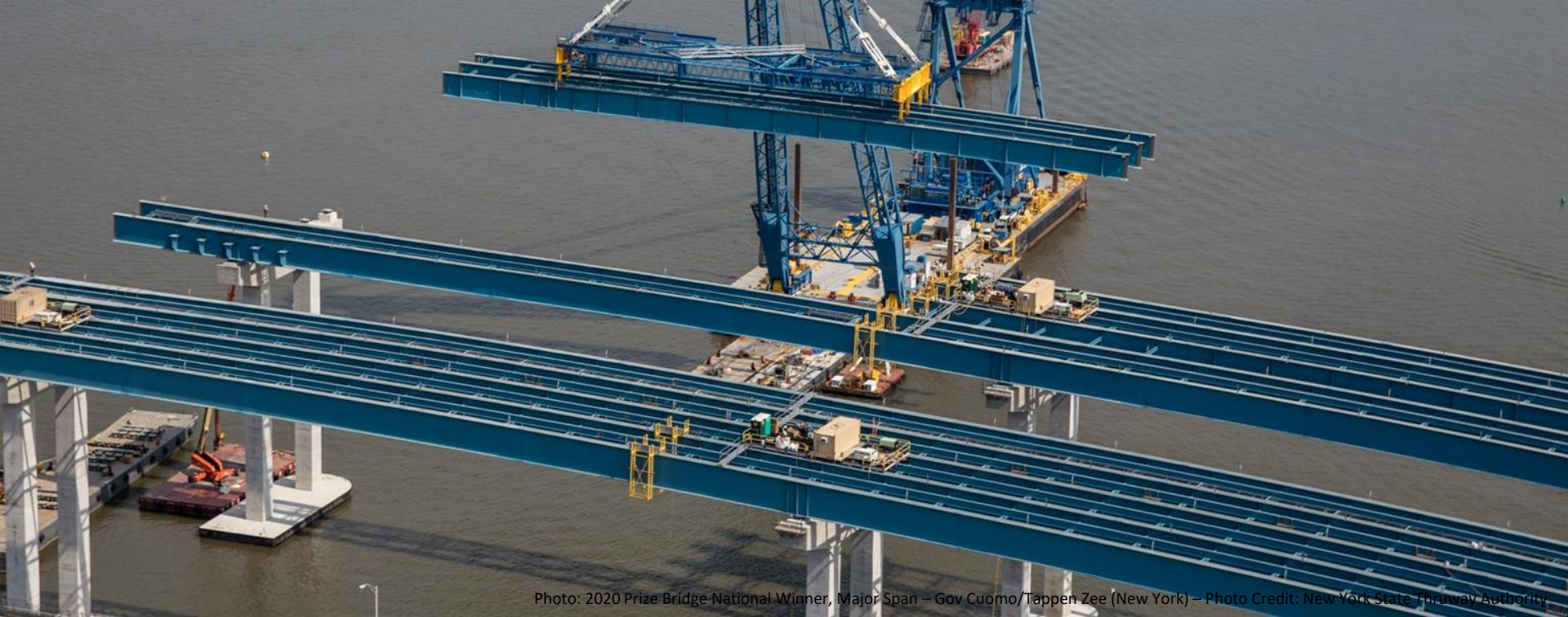
Photo: 2020 Prize Bridge National Winner, Major Span – Gov Cuomo/Tappan Zee (New York)