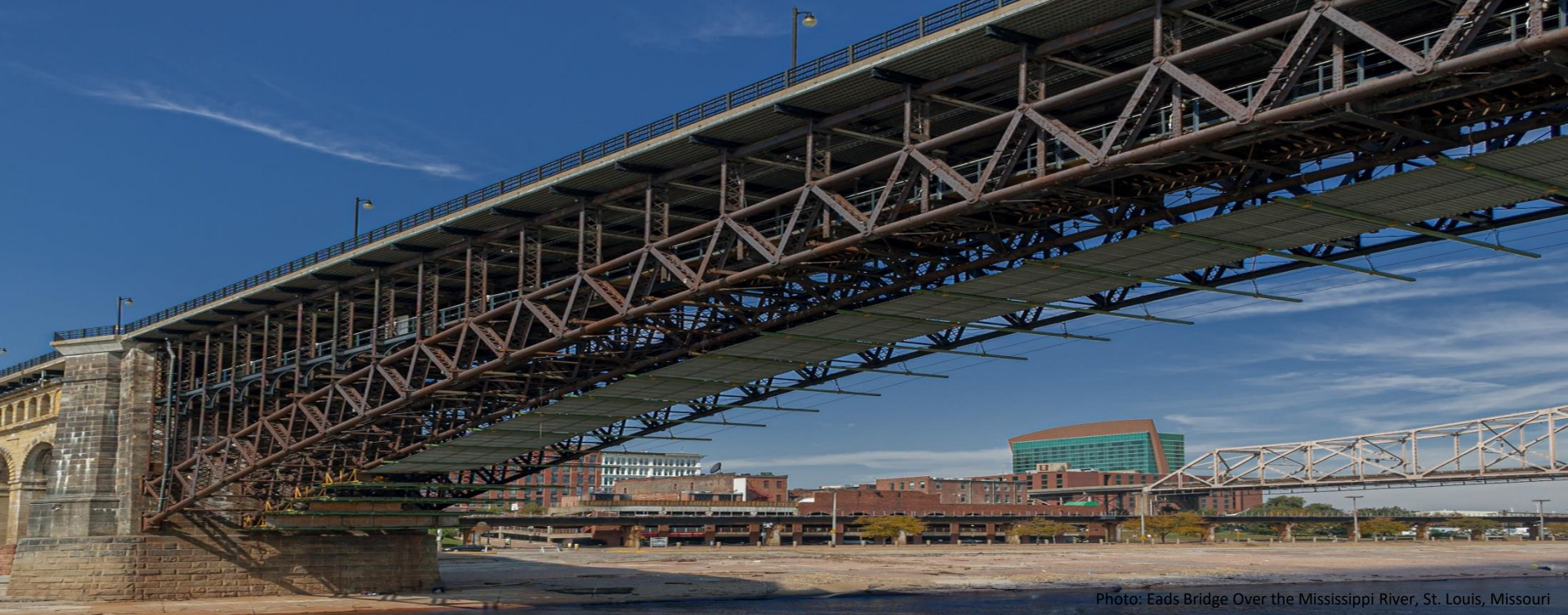
Photo: Eads Bridge Over the Mississippi River, St. Louis, Missouri