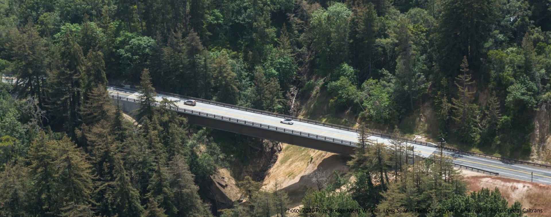
Photo: 2020 Prize Bridge Merit Winner, Long Span – Pfeiffer Canyon (California)