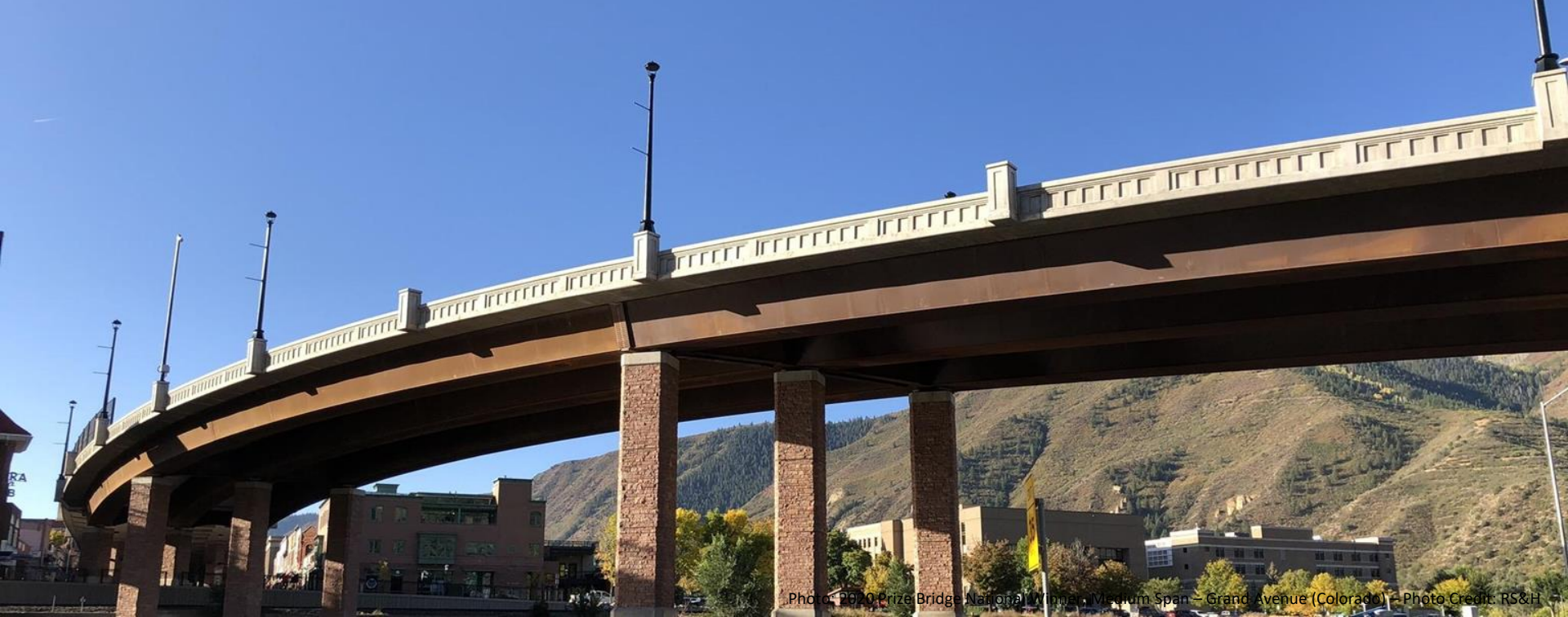
Photo: 2010 Prize Bridge National Winner Medium Span – Grand Avenue (Colorado)